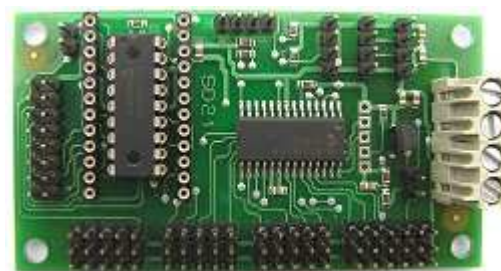
16 pin Header - Top View